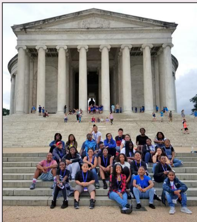
Members of the World is Our Classroom club sit on the steps of the Jefferson Memorial in Washington, D.C.

Last year, the club spent three days visiting Washington, D.C. More than two dozen WOK students, mostly seventh-graders, participated in a whirlwind tour of the